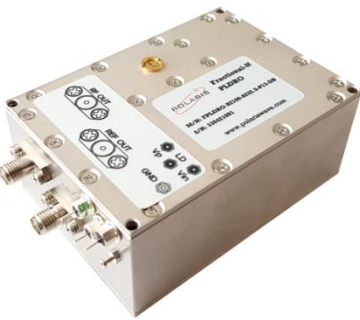
Fractional-N PLDRO with Internal OCXO

The PLDRO (Phase Locked Dielectric Resonator Oscillator) provides the ultra-low phase noise and an excellent frequency stability when it is phase-locked to a clean and stable crystal reference signal. The PLDRO provides ideal signal for commercial and military systems that require ultra-low phase noise, low spurious, and high frequency stability.