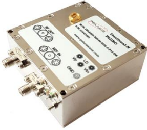
Fractional-N PLDRO using External Reference